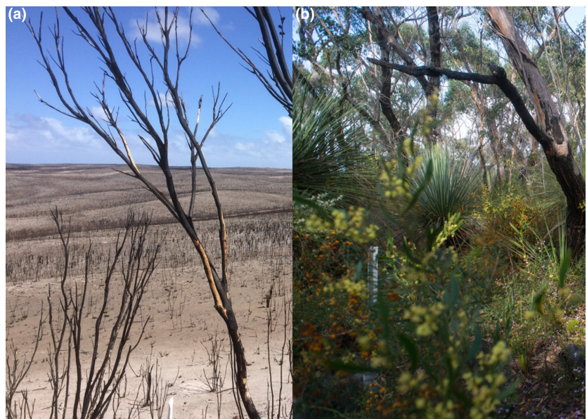
FIGURE 2 Photograph of the landscape following the 2019–2020 fire on Kangaroo Island.

This study utilizes data on feral cat activity from Hohnen et al. (2020), collected prior to the 2019–2020 wildfire. Nine arrays of between 14 and 44 motion sensor cameras were deployed between September 2017 and December 2018 (between 26 and 10 months pre-fire) across the study area (Table 1), and this study utilized data from seven of those arrays. This includes three arrays deployed in the forest, two in farmland and two on the forest–farmland border. The camera arrays varied in their design (Table 1), but all consisted of two to three parallel transects of cameras (forming a narrow rectangular grid), sometimes constricted by landscape features such as a narrow coastal isthmus, or farmland boundary. Most cameras were spaced approximately 700 m apart, but where the terrain constrained camera placement (e.g. a steep ravine, or a change in habitat type), they were placed slightly closer or further away (0.5–1 km). The spacing was chosen based on GPS tracking of 33 feral cats on the Dudley Peninsula